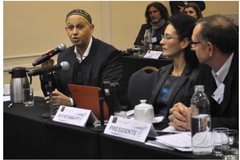
Minister of Environment of Argentina Rabbi Sergio Bergman welcomes the COP8

The Minister of Environment Rabbi Sergio Bergman welcomed the participants expressing good wishes for a productive meeting and a joyful stay in Buenos Aires.