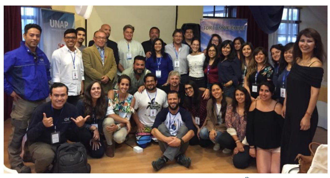
Participants of LaudOPO workshop on bycatch – Arica, November 29th, 2017

On November 29th, 2017, the members of the East Pacific Leatherback Network (LaudOPO) met at the "LaudOPO Workshop on Bycatch". Objectives of the workshop included updates of conservation projects, monitoring and the measures for reduction of bycatch, as well as identifying priorities and next steps regarding bycatch in the region. The workshop was held in the framework of the VI Sea Turtle Symposium in Arica.