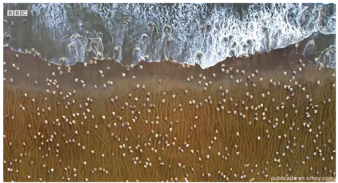
Sea turtles Arribada in the worldwide famous Ostional