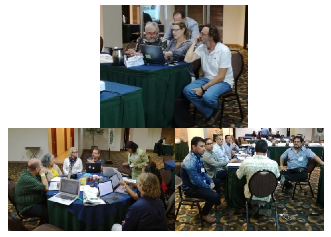
Scientific Committee Working Group Session - Panama

trend; and the Nesting WG agreed to update the IAC Technical Document on Nesting Areas with the information that the delegates will provide during the next meeting in 2018. Honduras offered to be the host country for the 15<sup>th</sup> meeting, the date will be decided with the host country.