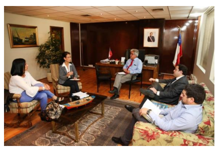
Undersecretariat of Fisheries and Aquaculture Chile

As a result from the meetings, and following up on the implementation of actions under the East Pacific Leatherback Resolution, IFOP will carry out workshops with fishermen on best practices to handle and release sea turtles incidentally caught in longline and gillnet industrial and artisanal fleets to strengthen compliance with the Resolution. The Fisheries Undersecretariat expressed their support by helping to achieve good attendance from the fishing sector. The Fisheries Undersecretariat and expressed their commitment to IFOP continue supporting the national sea turtle working group as they implement the sea turtle conservation measures that have been recommended for Chile under the Executive Director IFOP, and Ms. Patricia Zarate IAC.