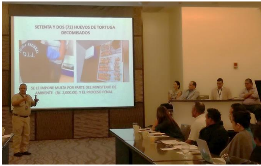
Presentation of the first criminal proceeding in Panama due to sea turtle eggs traffic.

The participants learned about the approval of Panama Action Plan for the Protection of Sea Turtles 2017 – 2021. Additionally, there was a review of the current regulations and their implementation in Panama, including a presentation of the first criminal proceeding that resulted in a $2,000 dollars fine to an individual because of illegal traffic of sea turtle eggs.